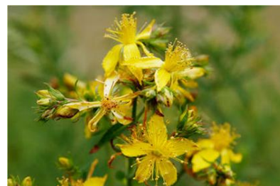
Active principles in St. John's Wort

The name of plant derives from its flowering around the time of St. John's Day, June 24. In recent years St. John's wort has been studied extensively as a treatment for depression. Most studies show that St. John's wort may help treat mild-to-moderate depression, and has fewer side effects than most other prescription antidepressants. But it interacts with a number of medications, so it should be taken only under the guidance of a health care provider.