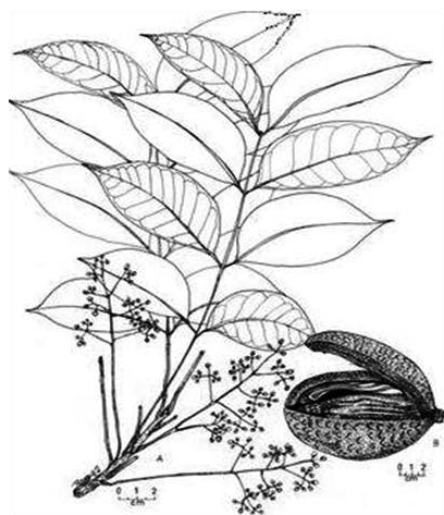
Fig. 1: Swietenia macrophylla species.

The species Swietenia macrophylla Figure 1, is a member of the family Meliaceae . S. macrophylla occurs mainly in open rain forest, semideciduous and deciduous forests (which lose their leaves in a partial way or total respectively, during the dry season) [1]. Its fruit seem to point upwards to the sky, therefore, it is commonly known as "sky fruit" [2]. S. macrophylla located in more than 40 countries including in Brazil, Bolivia, Mexico, Guatemala, Peru and other central American countries [3,4,2]. The tree of macrophylla is usually taller than 30 m, with straight trunk and cylindrical with 100 to 200 cm at breast height. The bark is dark reddish brown, entirely rosy, thick and deeply furrowed. The leaves are alternate with leaflets opposite or occasionally changed. The small flowers yellow-cream colored panicles. The fruit is woody, consisting of capsule, ovoid, color light brown, which opens on 5 shares, with 10 to 14 winged seeds [3,5].