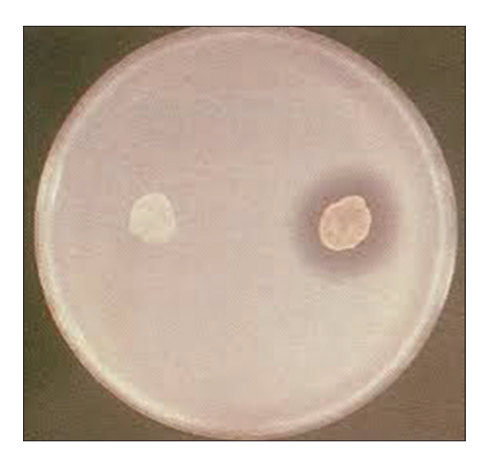
Fig. 1: Gelatinase production

Out of 89 isolates of E. faecalis identified, 72 (83%) from urine samples, 14 (15.7%) from pus samples, and 3 (3.3%) from blood samples. Out of 11 isolates of E. faecium identified, 8 (72.7%) from urine samples and 3 (27.2%) from pus samples (Table 1).