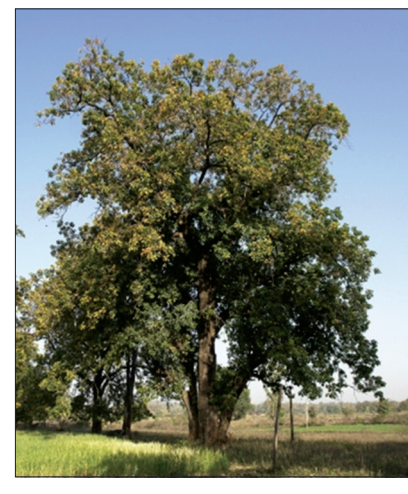
Fig. 1: Tree of Madhuca longifolia

Phytochemical Screening: The dried leaves were powdered and extracted with petroleum ether, chloroform, ethanol and water in soxhlet apparatus. The percentage yield was analyzed. The phytochemical tests were performed for the estimation of alkaloids, glycosides, flavonoids, and tannins in various plant extracts and resulted in the presence of