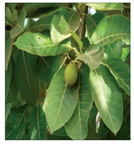
Fig. 2: Leaves and fruit of Madhuca longifolia

carbohydrates, gums, proteins, alkaloid, saponins, flavonoids and tannins; results are given in Table 1.