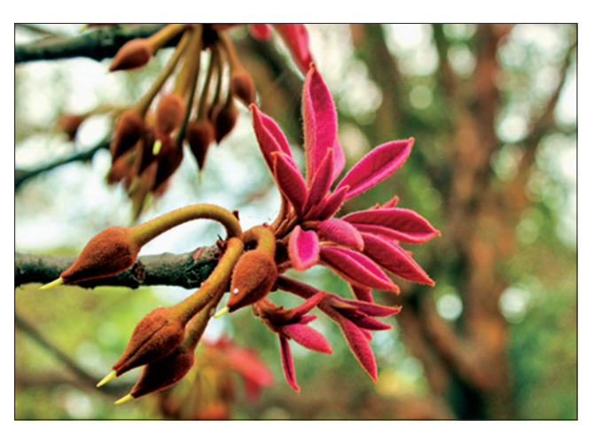
Fig. 3: Flowers of Madhuca longifolia

Preliminary phytochemical and physicochemical investigations of M. longifolia were performed in this study. These parameters are necessary for the identification of drugs and investigation of the bioactive constituents in medicinal herbs [13]. The presence of various chemical constituents in M. longifolia may be a potential cause of treatment of various disorders. The quality of the plant