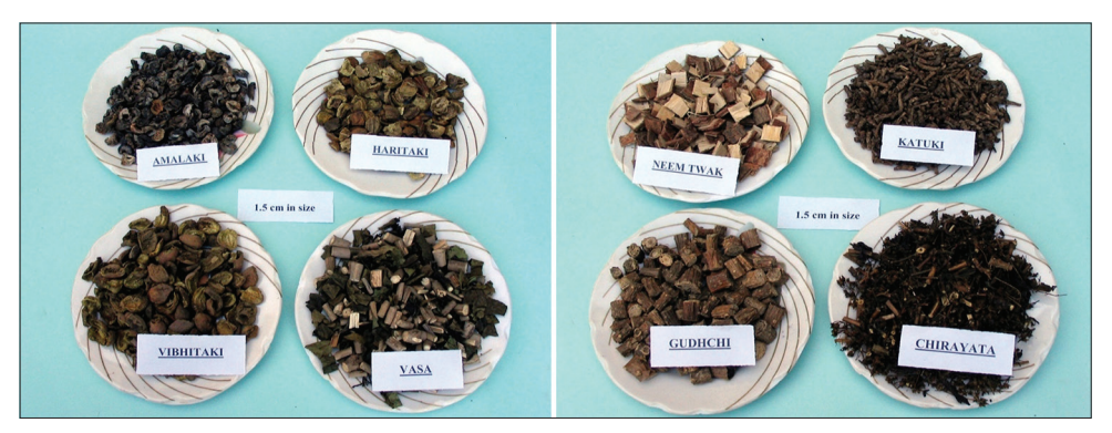
Fig. 6: Raw plant material (Particle size 1.5 cm)