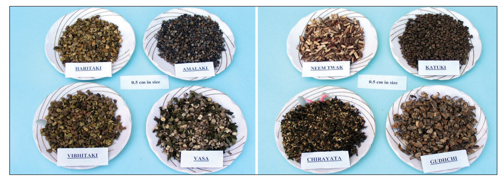
Fig. 4: Raw plant material (Particle size 0.5 cm)