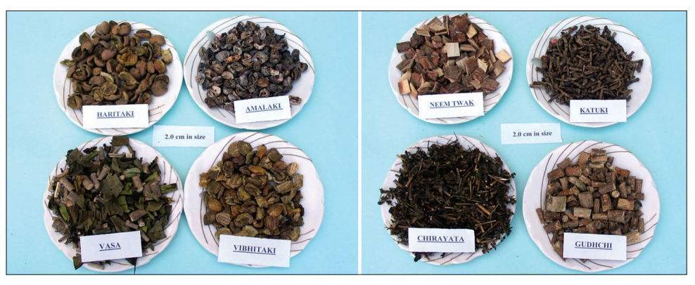
Fig. 7: Raw plant material (Particle size 2 cm)