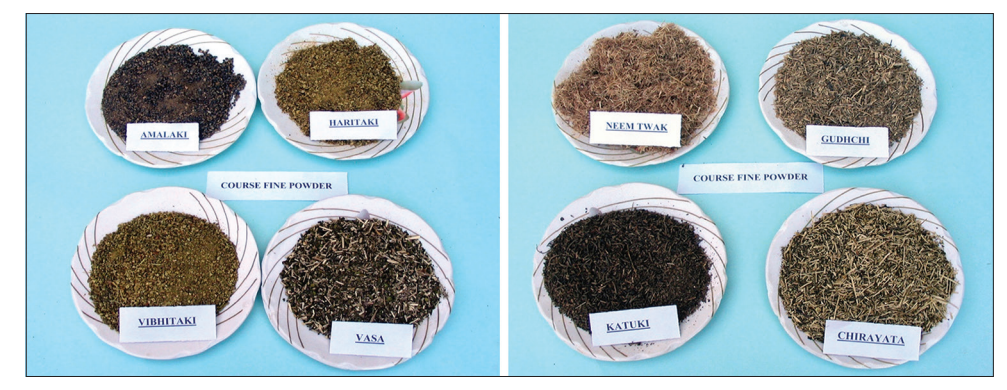
Fig. 3: Raw plant material (Coarsely powdered)

(solute), dissolves the water-soluble constituents and discharges it to the liquid media due to collapsement of boundary layer which results in the transfer of water-soluble principles into the solvent (water). The continuous heating and agitation during the Kwath nirmana enhance the extraction process by weakening the bounds, thereby separating the hydrophobic substances from hydrophilic substances.