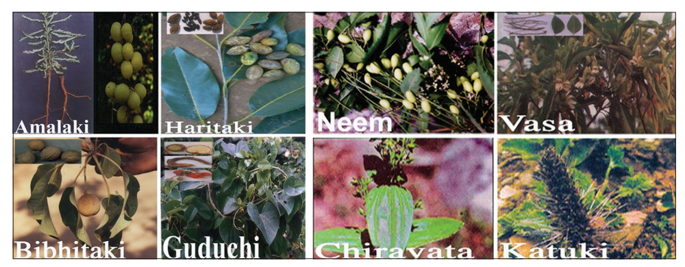
Fig. 1: Raw plant material

with the process. The yield, the color and the taste can vary from batch to batch, but the general, the final product is in liquid form, which looks somewhat like apple cider or light honey. Soaking of Kwathya dravya (solute) results in the softening of the drug due to diffusion of