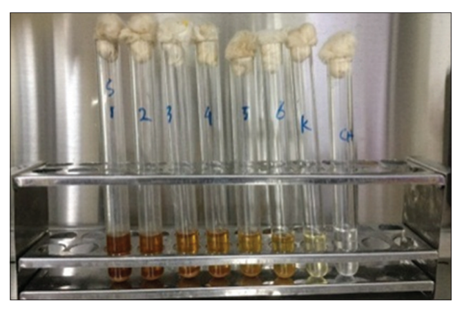
Fig. 3: The reaction tubes with concentrations of 50%, 25%, 12.5%, 6.25%, 3.125%, and 1.25% negative control and positive control were incubated for 24 h at 37°C