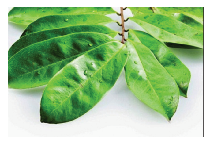
Fig. 1: Soursop leaf

leaves are dark green, while the young leaves are yellowish green. Soursop leaves are thick and somewhat stiff with pinnate leaf veins or erect in the main leaf veins.