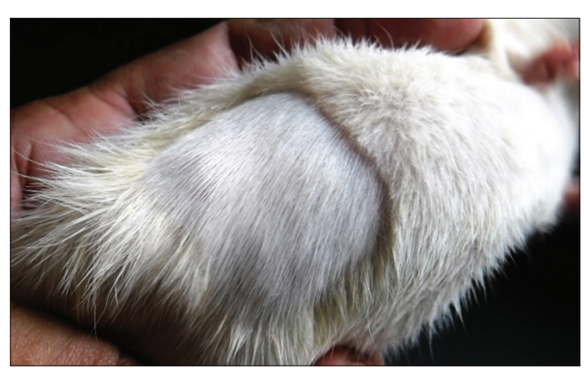
Fig. 3: Hair growth result at 20th day using HF2 formulation