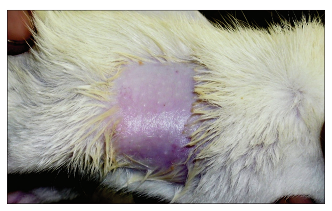
Fig. 1: Hair growth result at 0 day