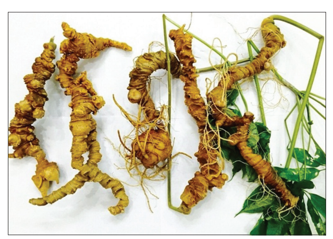
Fig. 1: The image of Ngoc Linh gingsen

Some areas in Vietnam still maintain traditional therapies including China town of Ho Chi Minh City, North Vietnam, and several cities. Traditional medicine hospitals and clinics are still considered an important component in the daily life of Vietnamese people [2]. In fact, the biological activity of many pharmaceuticals has been verified by reputable medical organizations. To promote the movement of keeping