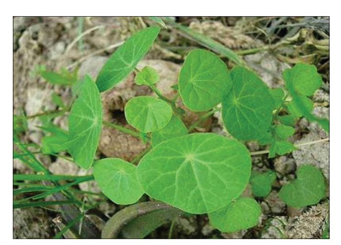
Fig. 2: The image of Stephania

traditional therapies, studies have been promoted and encouraged. One of the recent findings is the discovery of the "Ngoc Linh" ginseng.