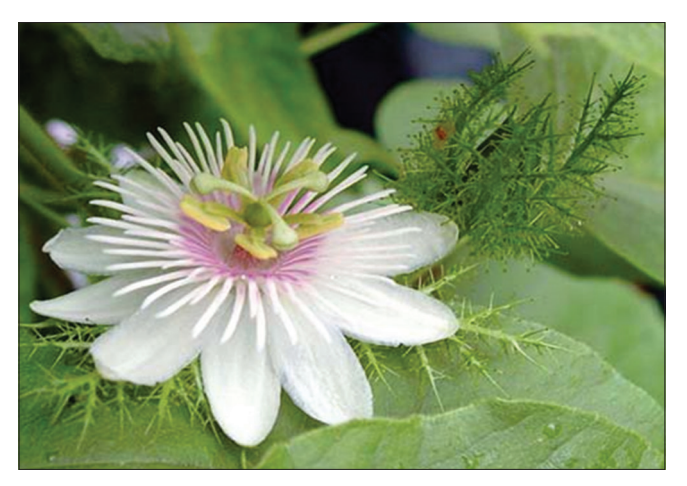
Fig. 5: The image of passiflora foetida

More than half of the respondents said that they enjoyed using traditional remedies made from plants. The study is mostly focused on the peasantry, the economically inferior, who do not dare to spend on redundant hospitals or they want to take advantage of available medicines. This also demonstrates the importance of herbal medicine in