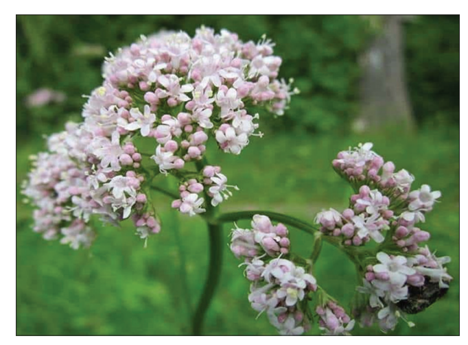
Fig. 4: The image of valeriana officinalis