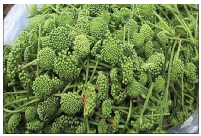
Fig. 3: The image of false gingseng

In fact, P. foetida has a very wonderful name with the meaning of "Happy Fairy," that is, those who drink P. foetida tea will have a feeling