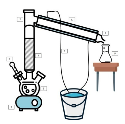
Fig. 1: Adsorption distillation process

In this study, the adsorbents used were synthetic zeolite 3A and white silica gel. Activation is carried out on the adsorbent using physical methods by heating it in a furnace. The heat generated by the furnace will evaporate water molecules and other impurities in the adsorbent, so the adsorbent absorption increases. The physical activation process aims to maintain the structure of the adsorbent. Synthetic zeolite was heated at 300 °C for 3 h, white silica gel was heated at 150 °C for 40 min [27].