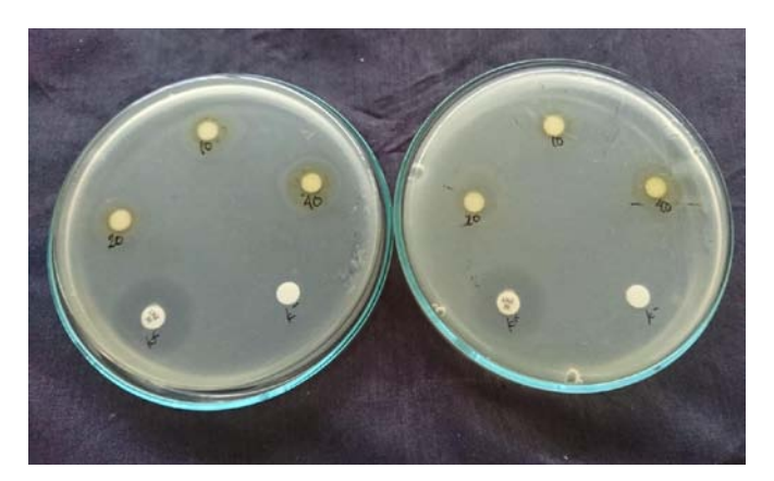
Fig. 2: Antibacterial activity test for 96% ethanol extract from Moringa oleifera Lam. leaves.

Notes: The data was given in mean+SD; n=2, The result of the antibacterial activity test showed that ethanol 96% extract of Moringa oleifera Lam. leaves has antibacterial activity from 10%.