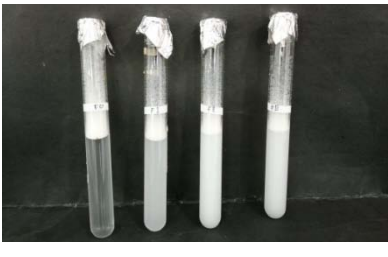
Fig. 2: Foam stability test