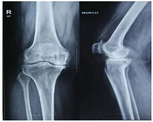
S-adenosyl methionine-After treatment

intercondylar joint space and femeropatellar joint space narrowing with subchondral sclerosis and osteophyte formation suggestive of severe Osteoarthritic changes. Post-treatment with diacerein shows no significant improvement radiologically.