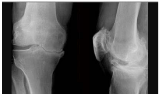
Severe osteoarthritis knee joint