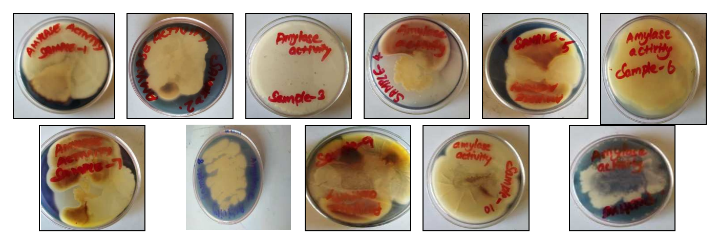
Fig. 2: A clear colourless zone produced around the colonies in starch hydrolysis test

Fig. 1: Growth of microorganism after 48 h incubation at 37 °C in Crowded plate method for screening of antibiotic-producing ability of soil sample 1 to 10