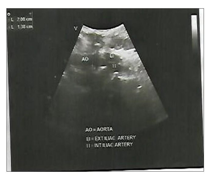
Fig. 2: Sonograph showing the longitudinal measurements of luminal diameter of the abdominal aorta in healthy subjects