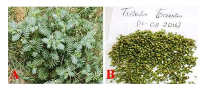
Fig. 1: Showing (A) plant of Tribulus terrestris (B) fruit of Tribulus terrestris