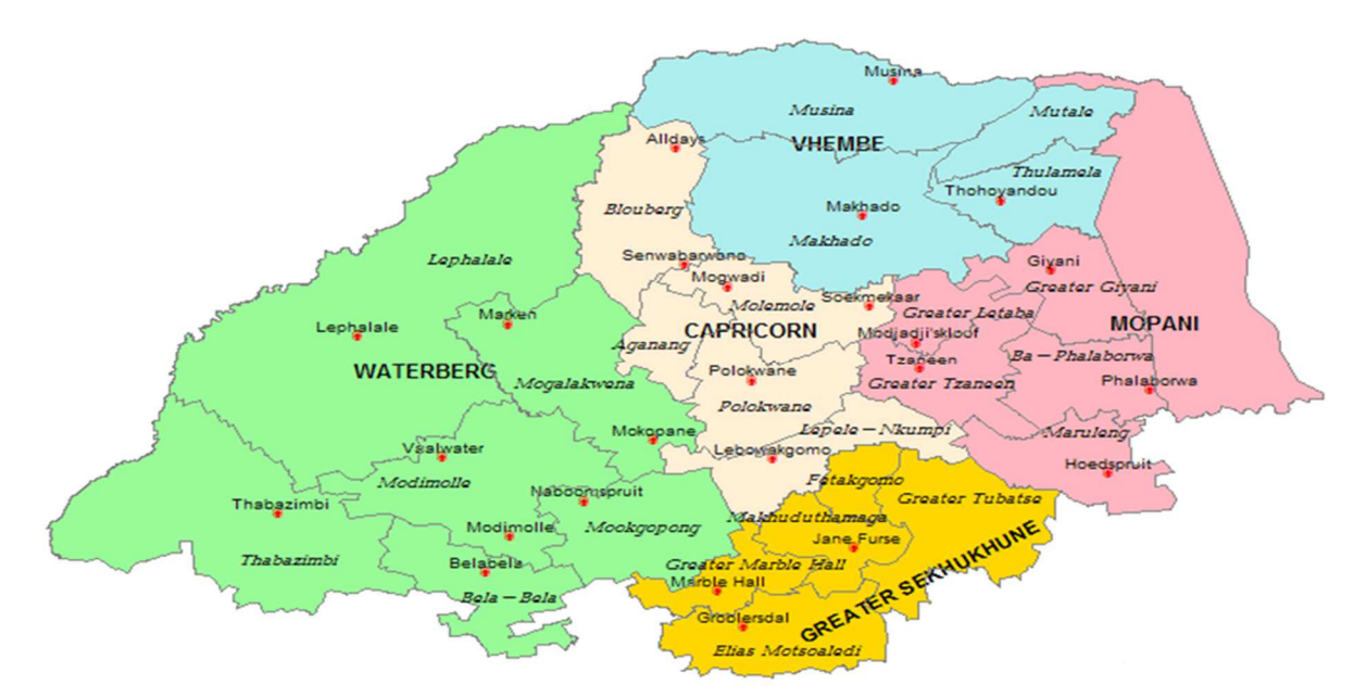
Fig. 1: The map of Limpopo province indicating the four districts (Capricorn, Sekhukhune, Vhembe and Waterberg) from which samples were collected (www.capeinfo.com/blogs/wp-content/blogs.dir/akela/files/2009/05/limpopo_dlghgovza.gif)