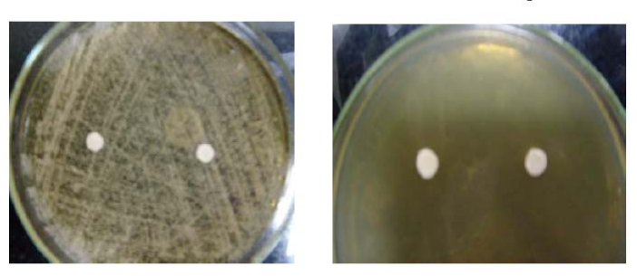
Fig. 2: Positive control: Melanocyl®Cream impregnated disc.