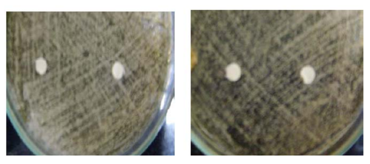
Fig. 1: M. zapota extract impregnated disc