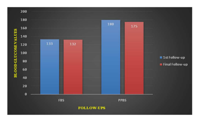
Fig. 1: Mean fasting blood sugar and mean postprandial blood sugar in control group