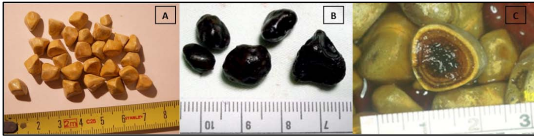
Fig. 1: (A) Cholesterol, (B) pigmented and (C) mixed stones